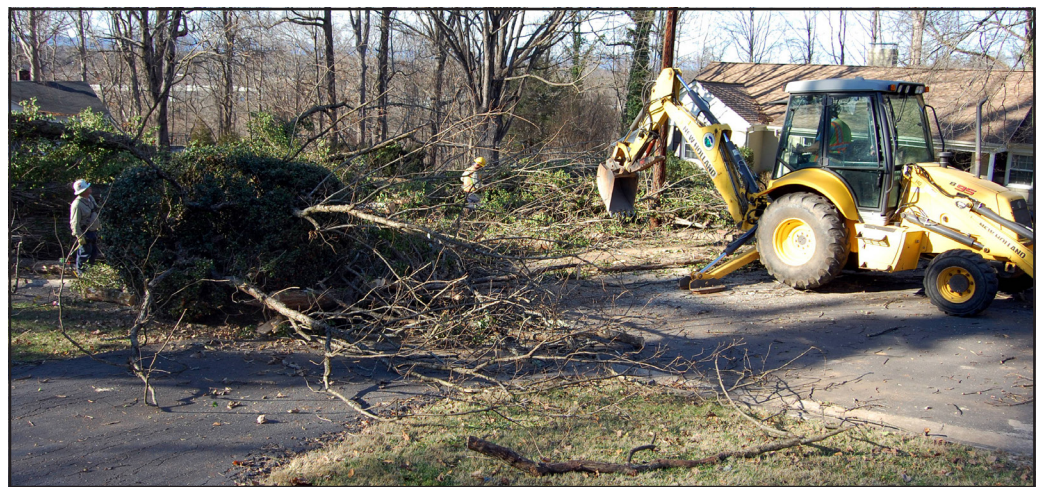
In February this year, a large tree fell across Woodbine Terrace. In that case, the city Public Works Department cleared the street and removed the tree from the street, but the homeowner was responsible for removing the section of tree on his property.

Public Works provides weekly brush collection to residents. Brush is collected the same day as trash. For more details about brush and bulk waste removal, visit http://www.morgantonnc.gov/brush .