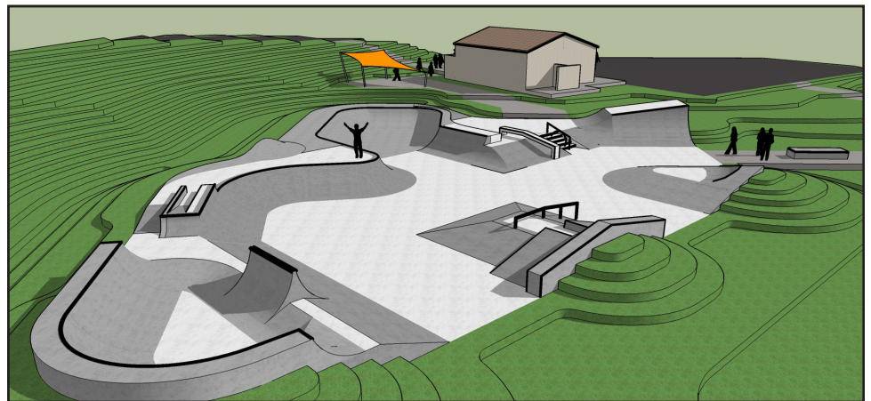
Conceptual design of the new skate park behind the Collett Street Recreation Center.

Not only will the new park meet the needs of local skaters, it will be one more piece in the recreation/tourism puzzle that helps draw visitors and dollars into Morganton. Read the full story and see what a local skater/business owner has to say about the new park at http://bit.ly/2t2YcNj .