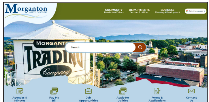
The City recently launched six new websites, which are packed with new features and content and have a completely revamped look.