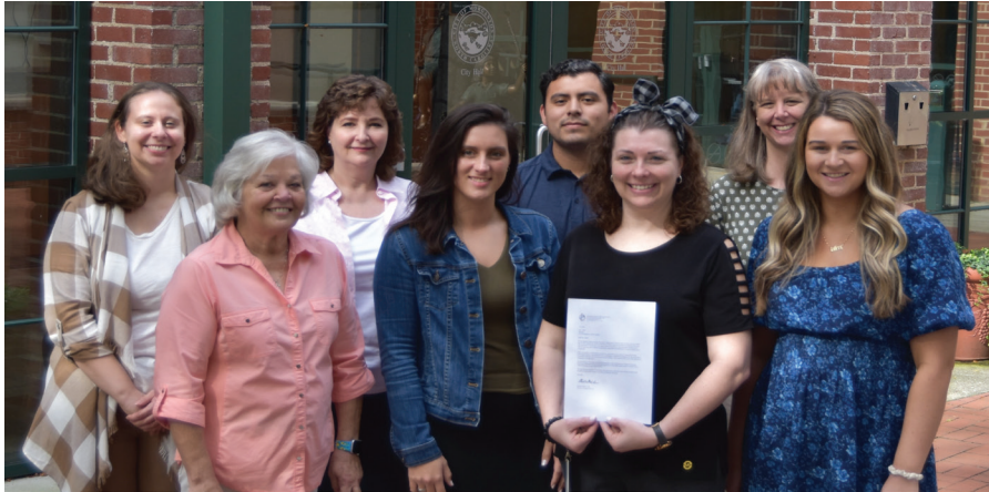
City of Morganton Finance Department